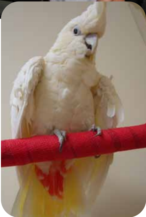
Rare, Red-Vented Cockatoo