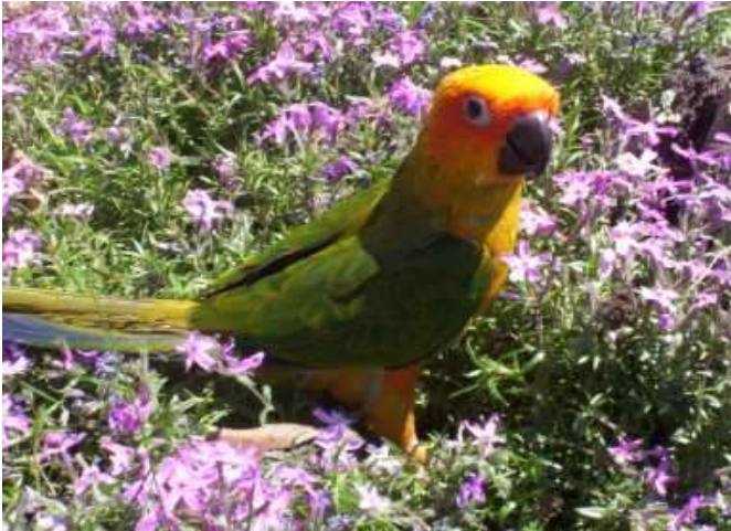
1 st Place, Conure by Traci Thompson