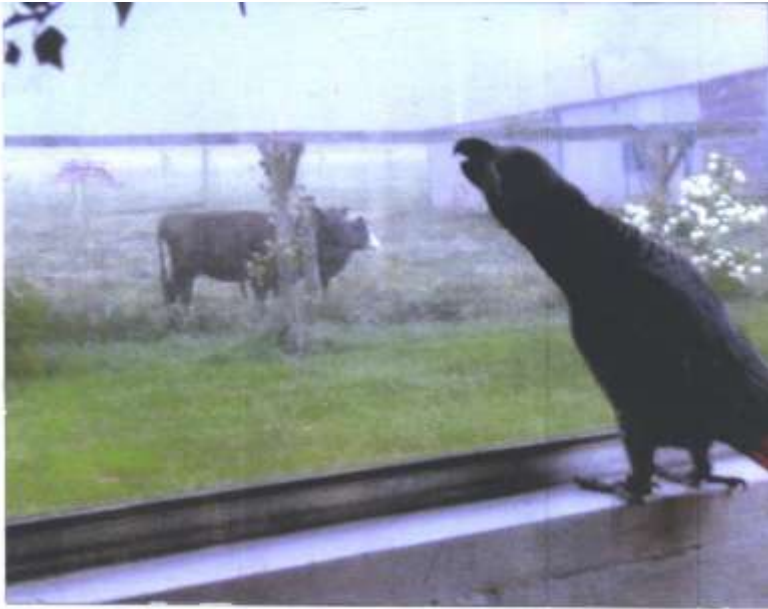
1 st Place, "A cow says mooo!" by Pete Rodes