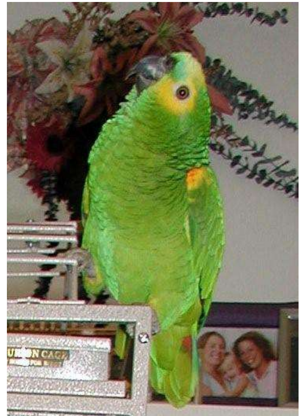
2 nd Place, Blue Front Amazon by Sue Brewer