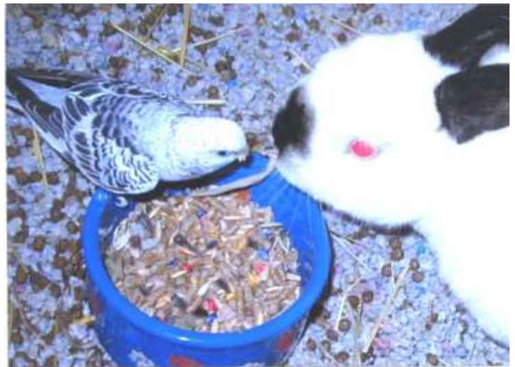
2 nd Place, "It's nice to share." by Pete Rodes