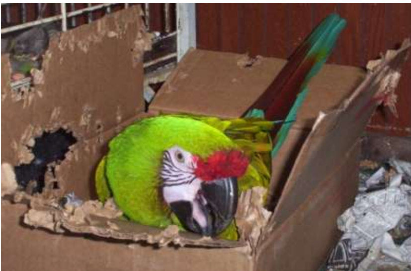
3 rd Place, "Cardboard is yummy!" by Traci Thompson