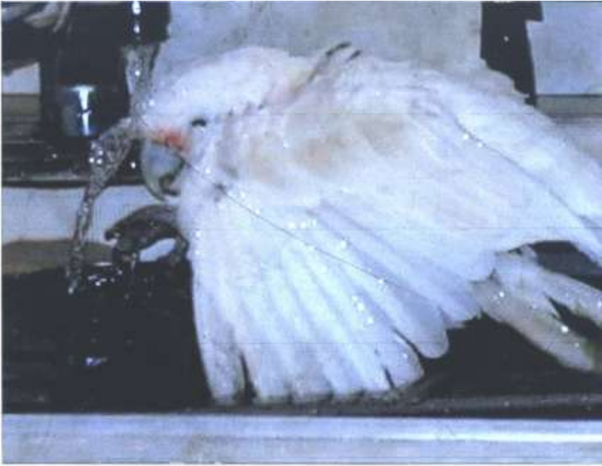
1 st Place, Cockatoo by Pete Rodes