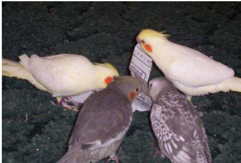
2 nd Place, "Whose turn is it to pay the bill?" by Traci Thompson