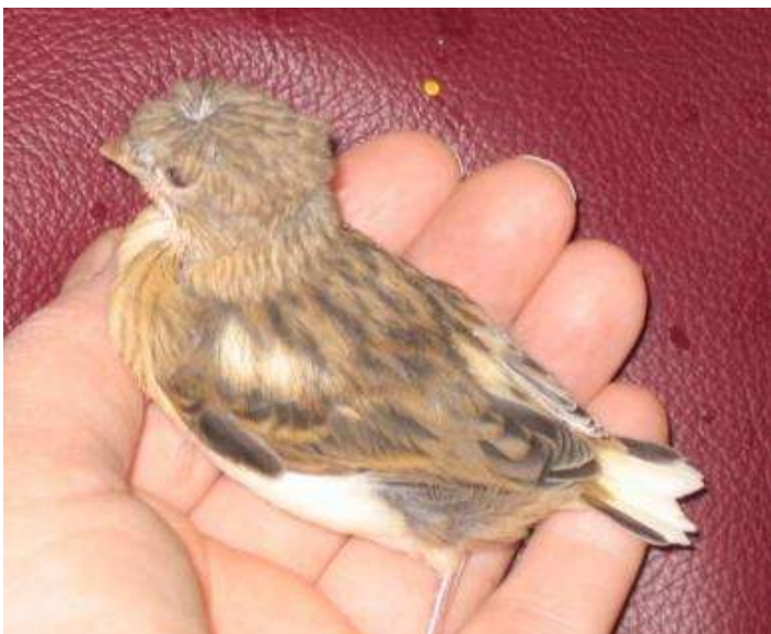
3 rd Place, Little Fella by Pix Mahler