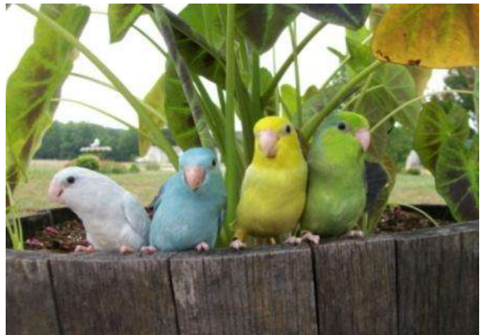
2 nd Place, Parrotlets by Traci Thompson